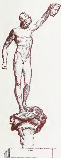
WAX MODEL FOR THE PERSEUS.